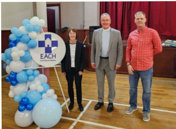
Speakers at the 20 th Anniversary Event