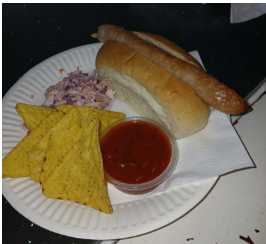
Sizzler Sausage Hot Dog