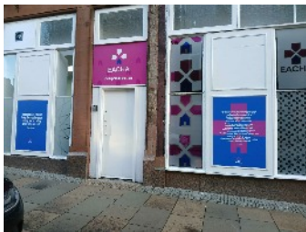
The new hub

East Ayrshire Churches Homelessness Action held its Annual General Meeting in October. This is the one day in the year when all strands of the charity report on progress over the past year, and it's the opportunity to reflect on how far we have come over the years.